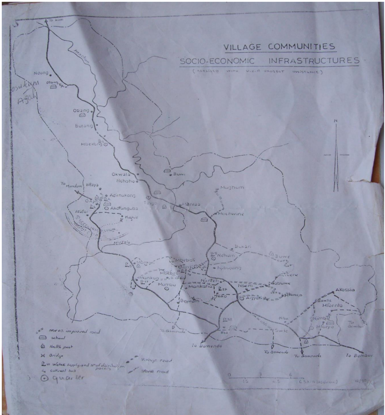
Figure 3: Map of Bafut

The main ethnic group is the TIKAR (Tikari) which migrated in the 18 th century. The most fragmented inter-ethnic groupings which are considered to have a relation with the Bafut people are the Bansa, Nsungli, the Aghem, Wedikum, and the kom. These constitute a very Tikar group which migrated down together probably from the Lake Tchad area to form a western branch, while the Bamileke and the Bamoum, who after migrating down from the Adamawa about the 18 th century, decided to take an Eastern direction to settle in the Eastern Cameroons.