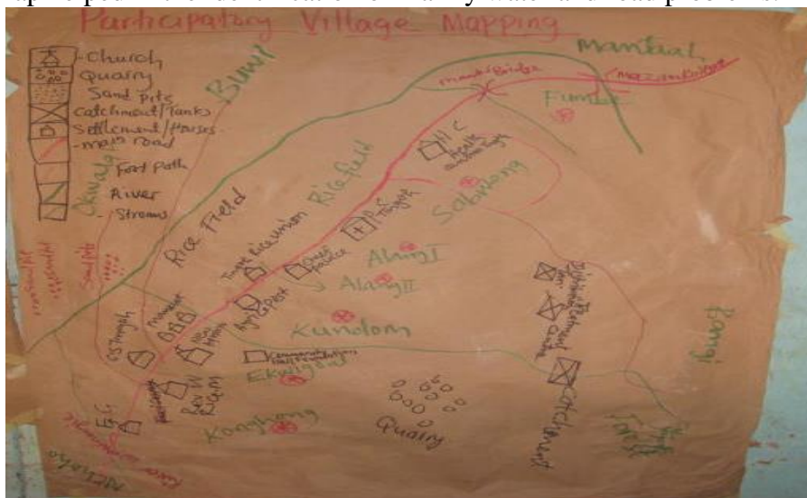
Figure 1: Sample Participatory Village Map Transect

The village map helped in the identification of mainly water and road problems.